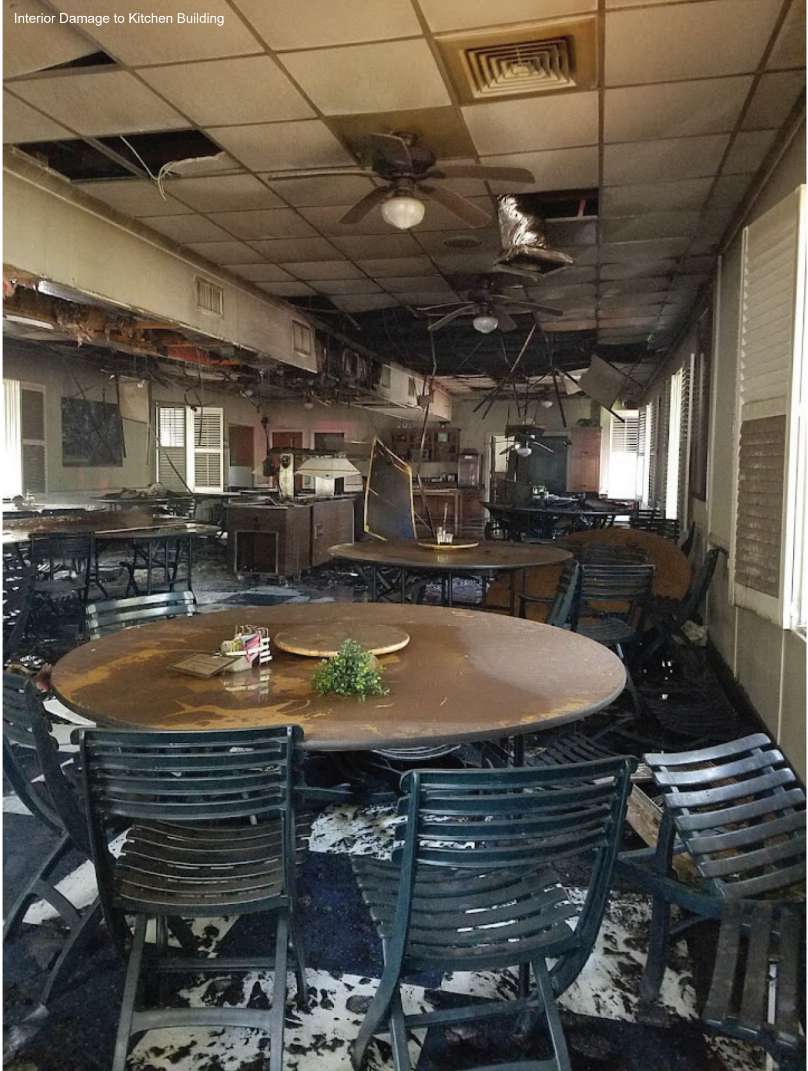
Interior Damage to Kitchen Building