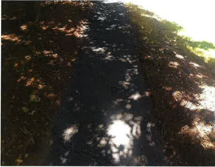
Area 5: 17 Square Yards