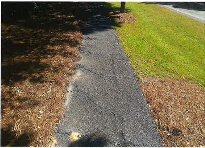
Area 6: 112 Square Yards