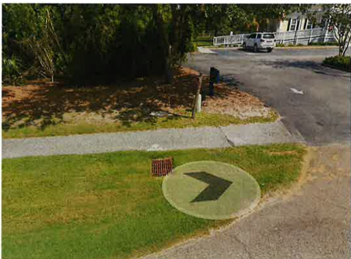
Area 7: 2 Square Yards