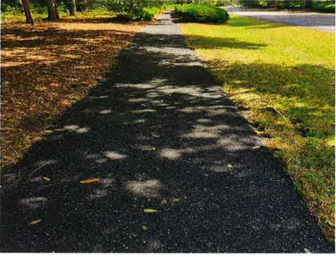
Area 4: 17 Square Yards