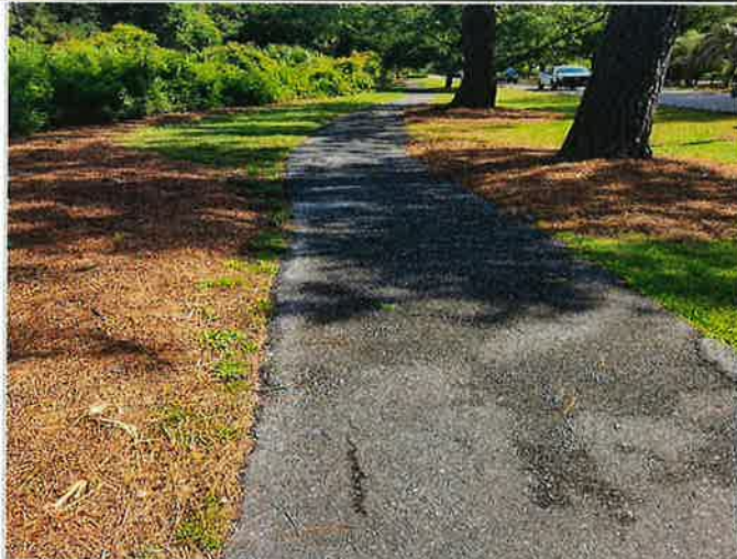
Area 1: 28 Square Yards