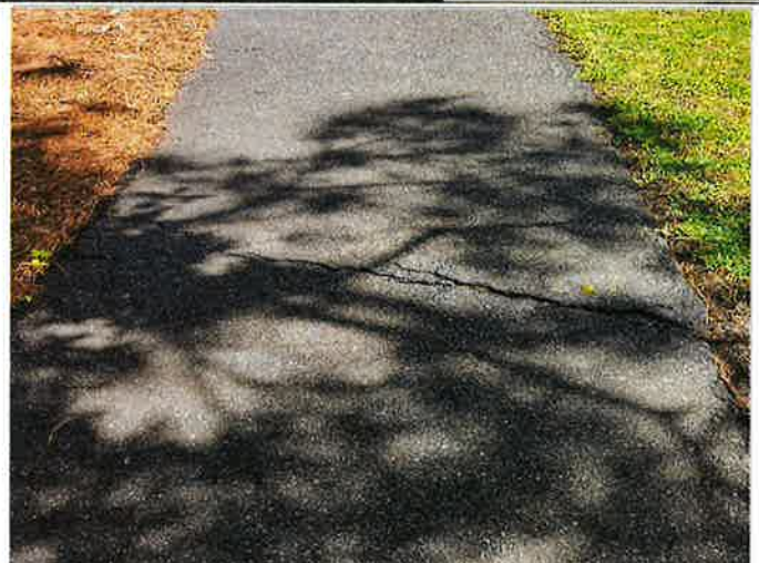
Area 2: 5 Square Yards