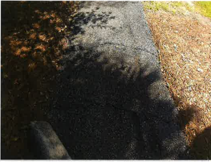
Area 6: 112 Square Yards