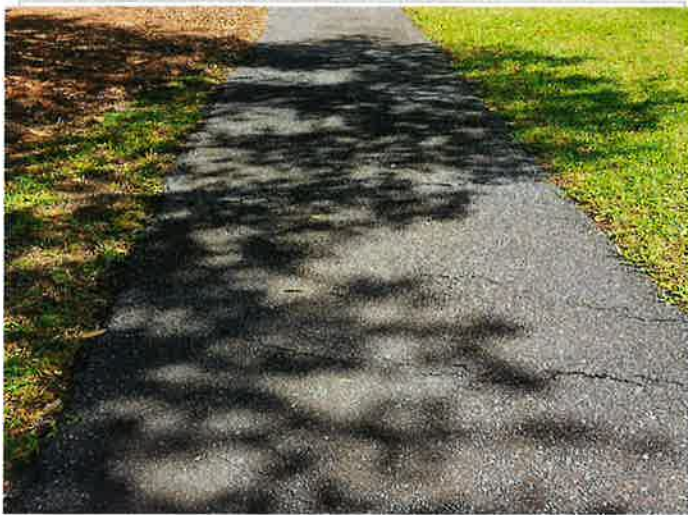
Area 3: 39 Square Yards